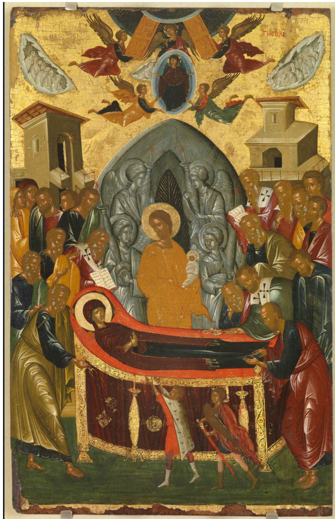
—John of Damascus, Monk and Presbyter, A Discourse on the Dormition of Our Lady, the Mother of God, Homily III

Let the breezes blow, filled with grace as soft as dew! Let all creation celebrate the ascent of the Mother of God!